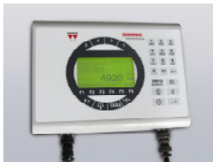
Agribusiness Terminal 3031

Soehnle Professional is characterized by innovation and quality! We listen to our customers and see your problem as our challenge! You need prove? Continue reading our performance and success regarding cooperation with fodder mix weighing in the agricultural business.