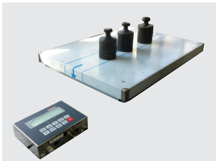
Calibration 15 kg and 2/5 g scale interval